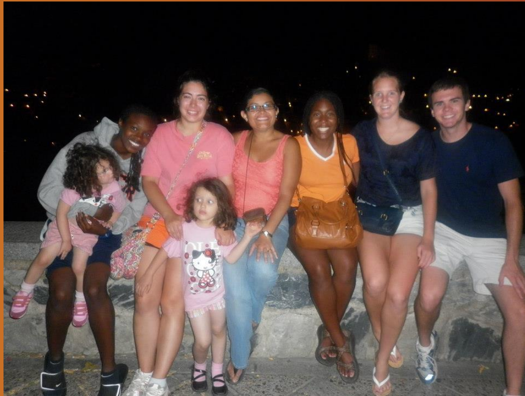
City Tour at Night