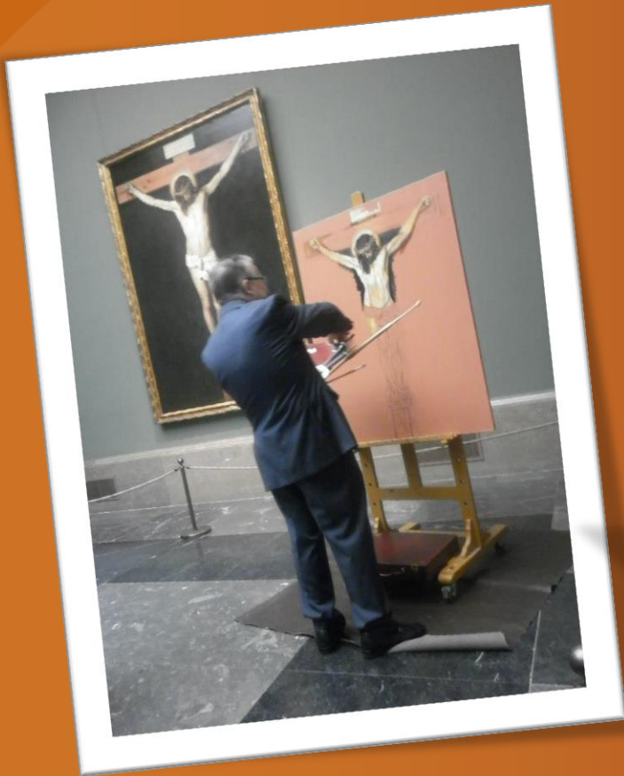
El Prado Museum