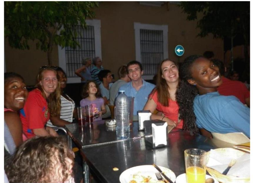
Watching a Soccer Game on the Street