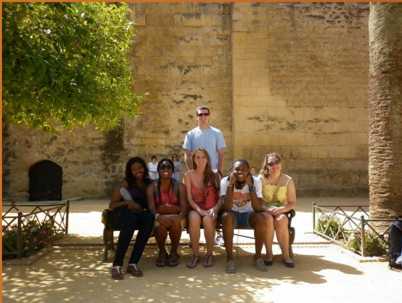
Alcázar de los Reyes Cristianos