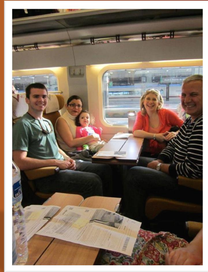
Ave: High Speed Train