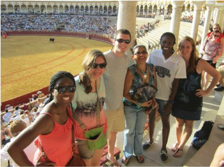
Plaza de Toros