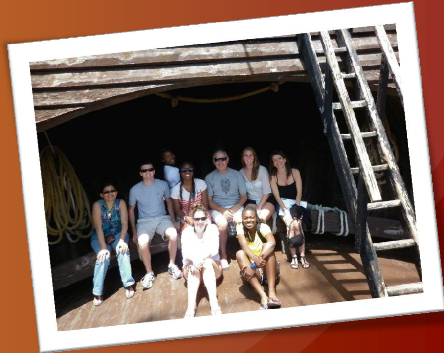
Real Size Replica of the Santa María